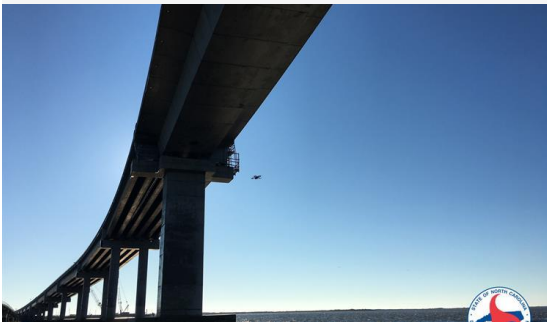
Drone Delivery to Ocracoke